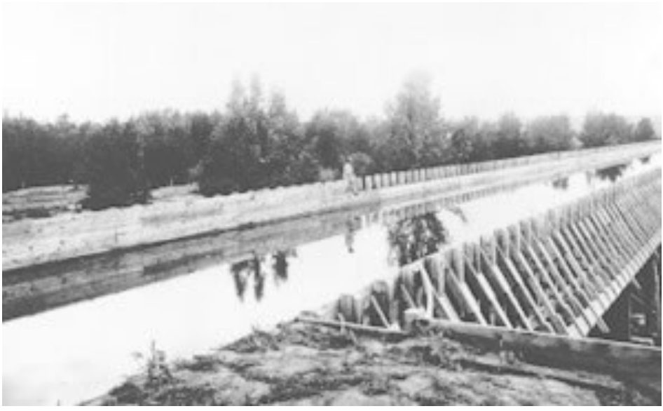
Highline Canal flume under construction in 1884

Contact Rebecca Kast at 303-730-2639 for reservations.