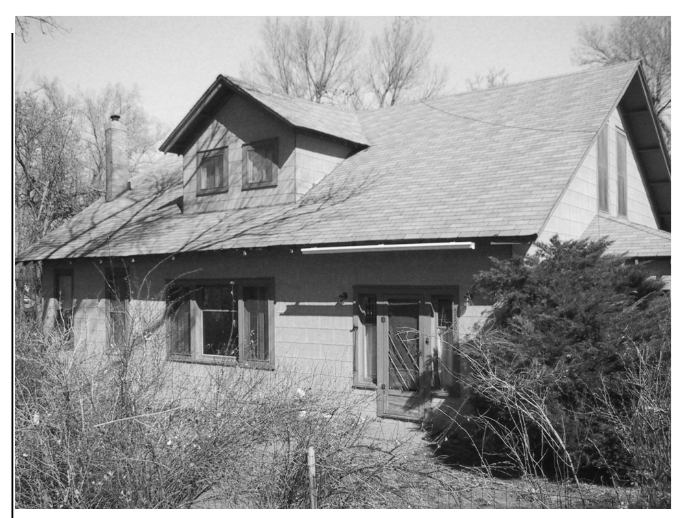
Ed Bemis house in 2006, before landscape improvements.

Hathaway said renovation priorities for the house include repairing the leaded glass windows, replacing the screens, sanding the floors, repainting the inside and outside, and eventually replacing the roof and removing the asbestos siding.